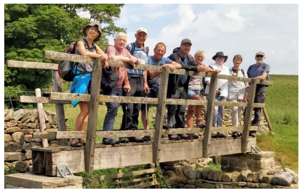
The walking group making the most of the fine weather