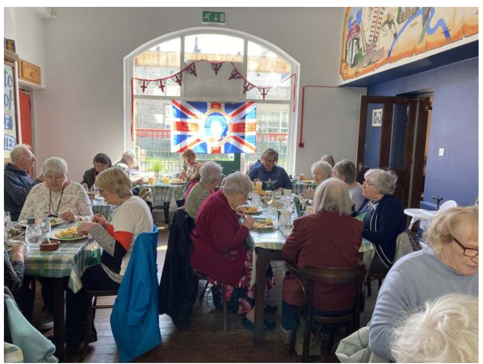
The dining room of the Brief Encounter Bistro at Carnforth Station

The CRP is happy to arrange visits to a variety of places, suitable for those living with dementia along the Leeds-Morecambe route. For those nearer Lancaster the possible visits could be to Skipton, Keighley or Saltaire. Whilst for those living nearer to Leeds: Morecambe or Carnforth. Bentham's sensory farm and the Forest of Bowland are potential destinations for groups from both ends of the line. Please contact us by telephone on 015242 98940 or by email if you wish to pursue this.