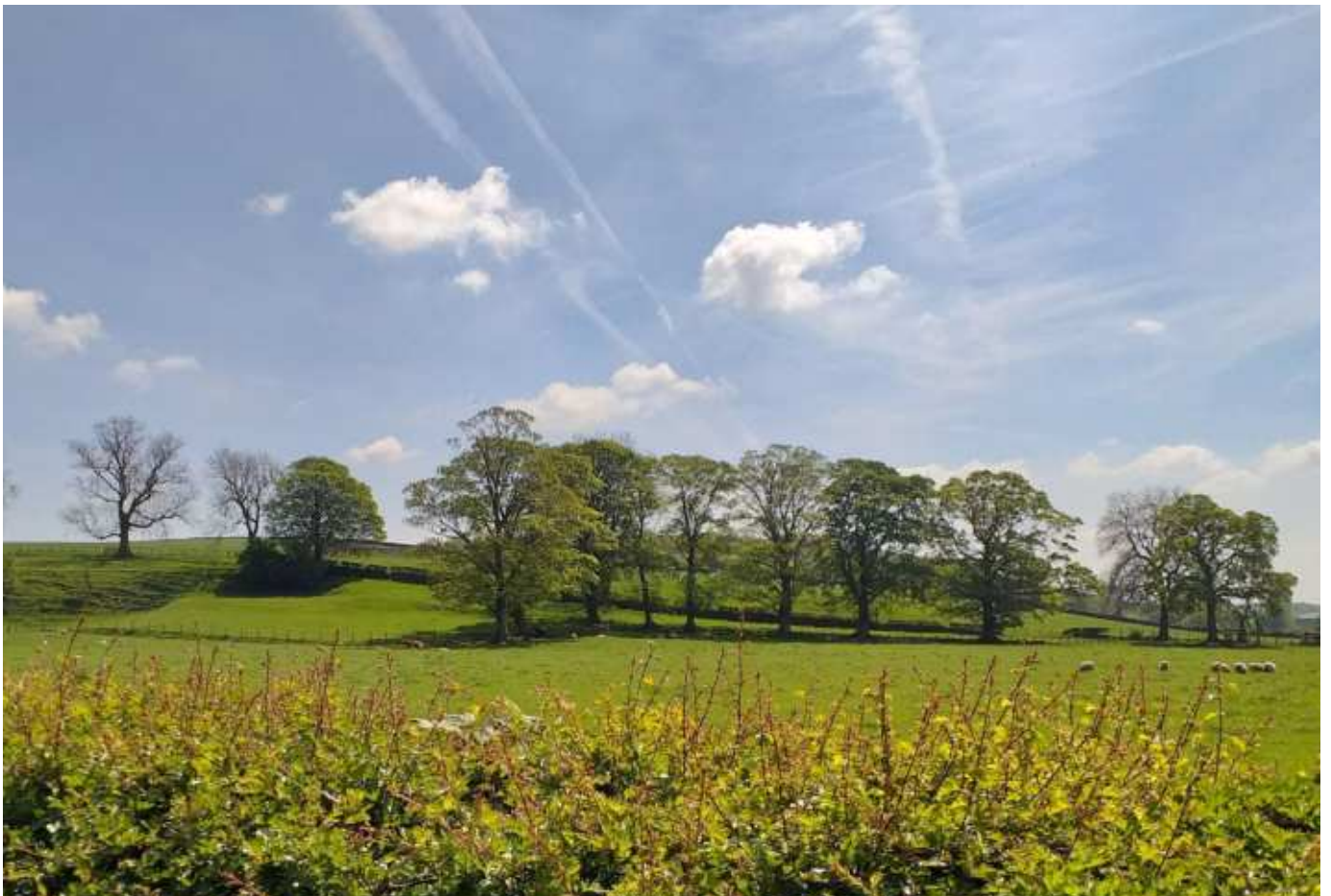
Tenley Hill, Hellifield, in the June sunshine