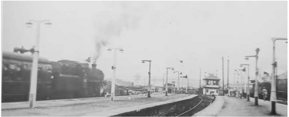
The North Bay at Hellifield Station in the early 1960's, pictured above. Note the North Junction Signal Box. The box controlled the line, carriage sidings to its rear, the goods yard opposite and the lines in and out of the Engine Shed yard etc. The Engine Shed is to the right. It was closed on the 27th June 1963 and on the 20th April 1964 the station was closed to goods. The signal box eventually became surplus to requirements and closed in the mid 1960's.