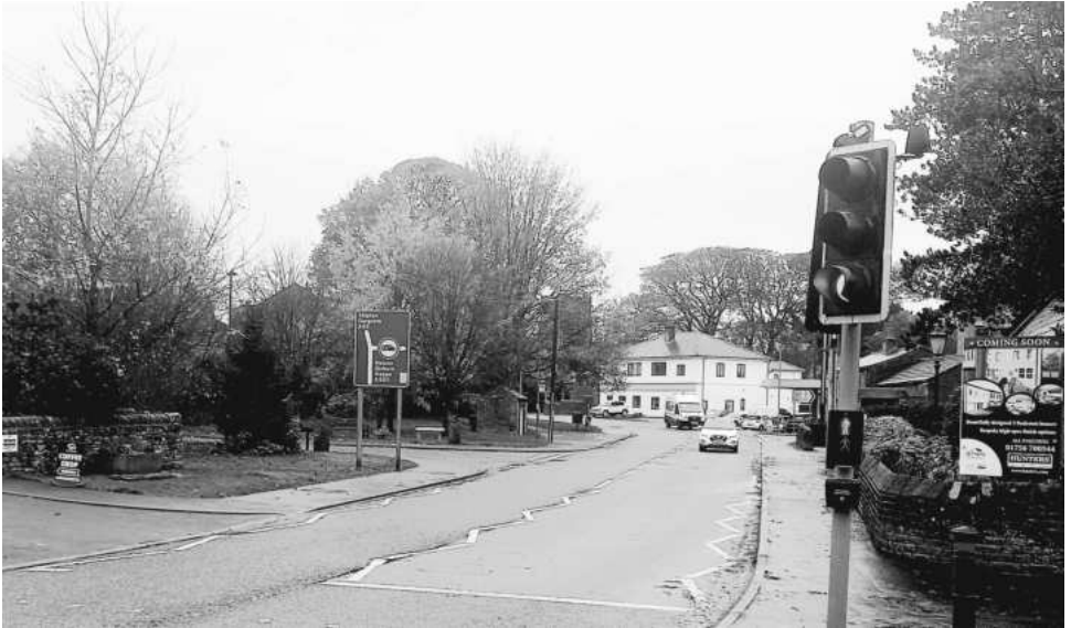
The same view today. The entrance to the Auction and the buildings on the left have now disappeared and the 'new' housing estate on all the old Auction land has changed the aspects on this side of the road.