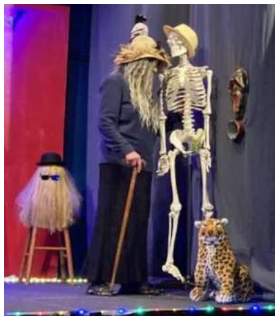
Grandma, dead husband, Cousin It and Leonardo the stuffed leopard!