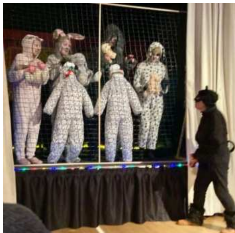
Animals in cage with Demonica the cat

Hellifield made Christmas very special again this year with the Christmas panto The Pets A’Peel (described in detail above), which those involved hope you enjoyed. The photos below show two of the stage scenes, including the cage scene where all the animals were trapped ready to be transported to the dreaded Long Preston Farm.