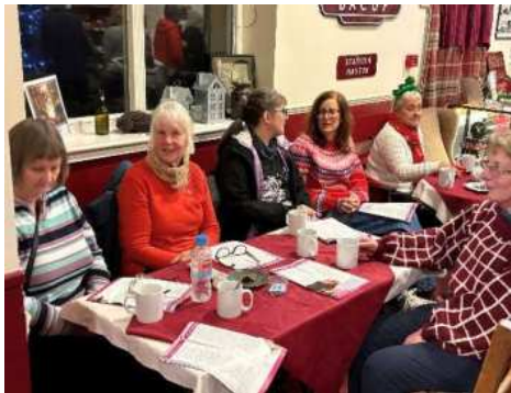
Picture taken at the Methodists Carol Service at the Station Café

There were also the advent Calendar windows – so thanks to everyone who made an effort to decorate their windows and to all those who took the time to walk around and see the amazing displays. The magazine set up a children's Christmas Card competition and all the entries were amazing; not to be outdone, the football team produced a Christmas Quiz!