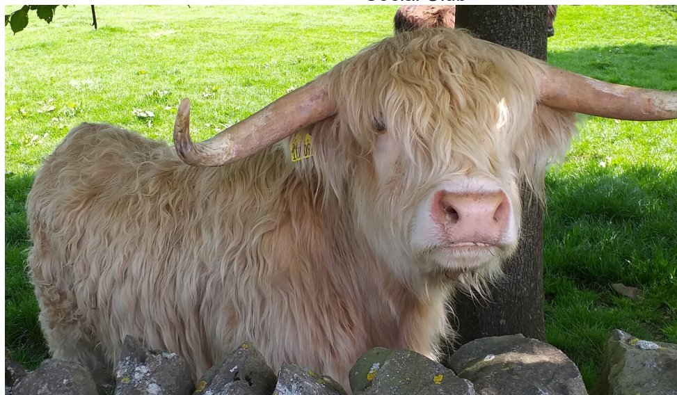
A friendly face from Gisburn Road