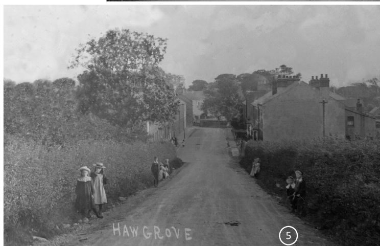
5. Children playing on Haw Lane, looking down towards Haw Grove (formerly Old Station Road) and the village.