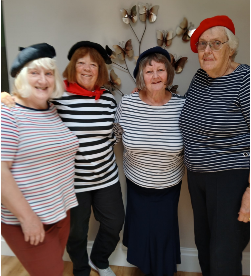
WI - French style

Fun was had by all at our Summer bash where French style food was enjoyed along with games and a quiz based on Paris and previous Olympic Games (in Celebration of this year's Olympics help in Paris). Thanks go to members for bringing along some delicious desserts for everyone to enjoy. A great time (as always) was had by all who attended.