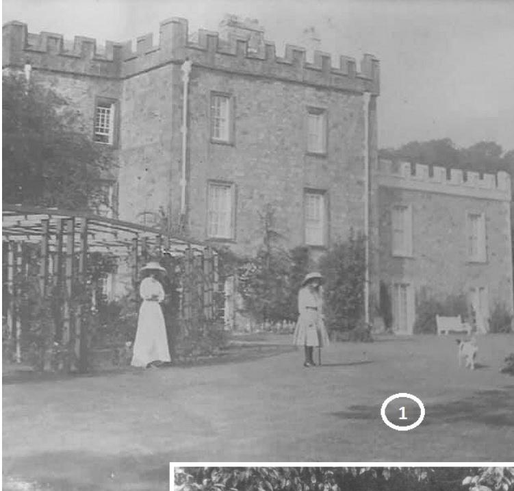
1. A pleasant summer's day in the gardens of the Peel.