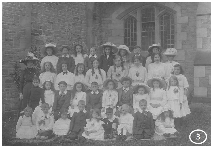
3. Pupils of the Haw Grove Methodist Chapel Sunday school pose for their photograph outside St. Aidan's church.