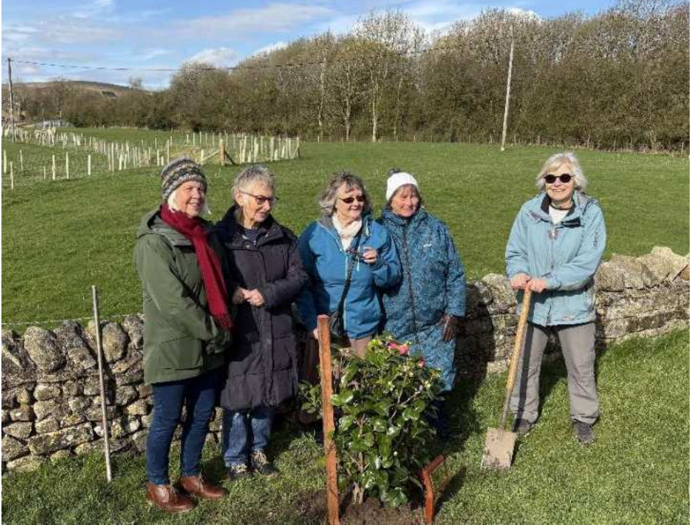
Members of the WI celebrating the planting

Parish Councillors were sad to hear that the Hellifield Women's Institute is closing following their final meeting in March but understand the reasons for this. The organisation has been active in the village since 1949, and supported many activities and events through the years, benefitting the local community. For example, the WI provided the village Christmas tree, which was planted several years ago, and in commemoration of the Queens Golden Jubilee the WI planted an English oak tree at the bottom of Hammerton Drive.